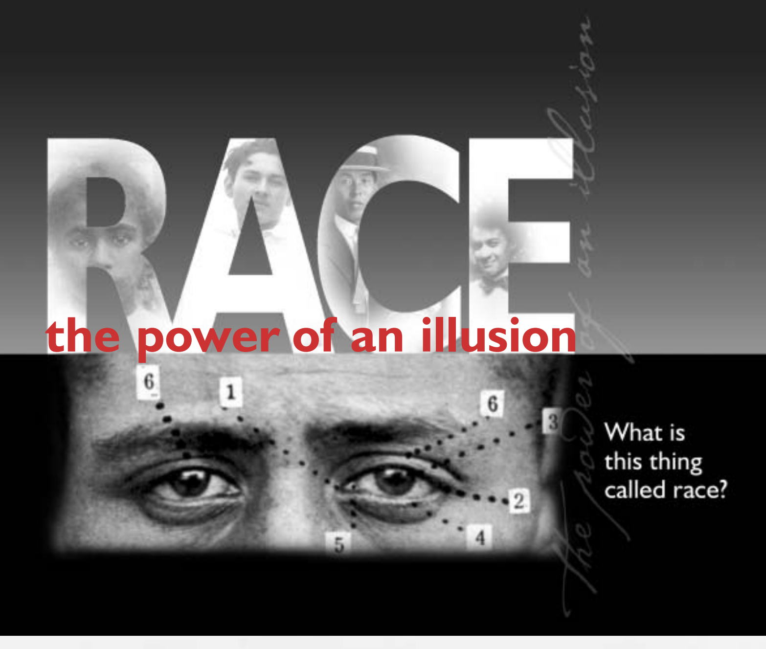
[i]tvs community connections project