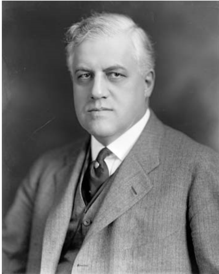
A. Mitchell Palmer