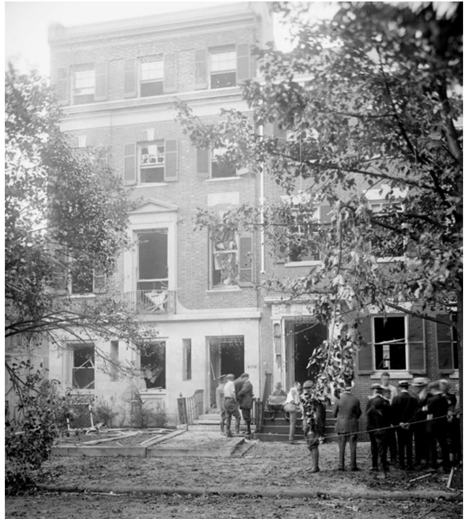
Attorney General Mitchell Palmer home after bombing