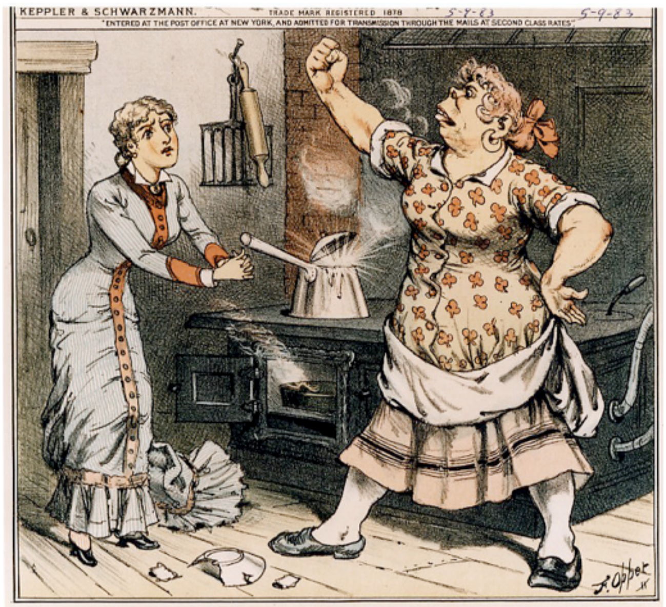
THE IRISH DECLARATION OF INDEPENDENCE THAT WE ARE ALL FAMILIAR WITH.

This cartoon by Frederick Burr Opper was published in the magazine Puck in 1883. It shows a non-Irish woman imploring her Irish cook to continue her duties. The cook shakes her fist in defiance.