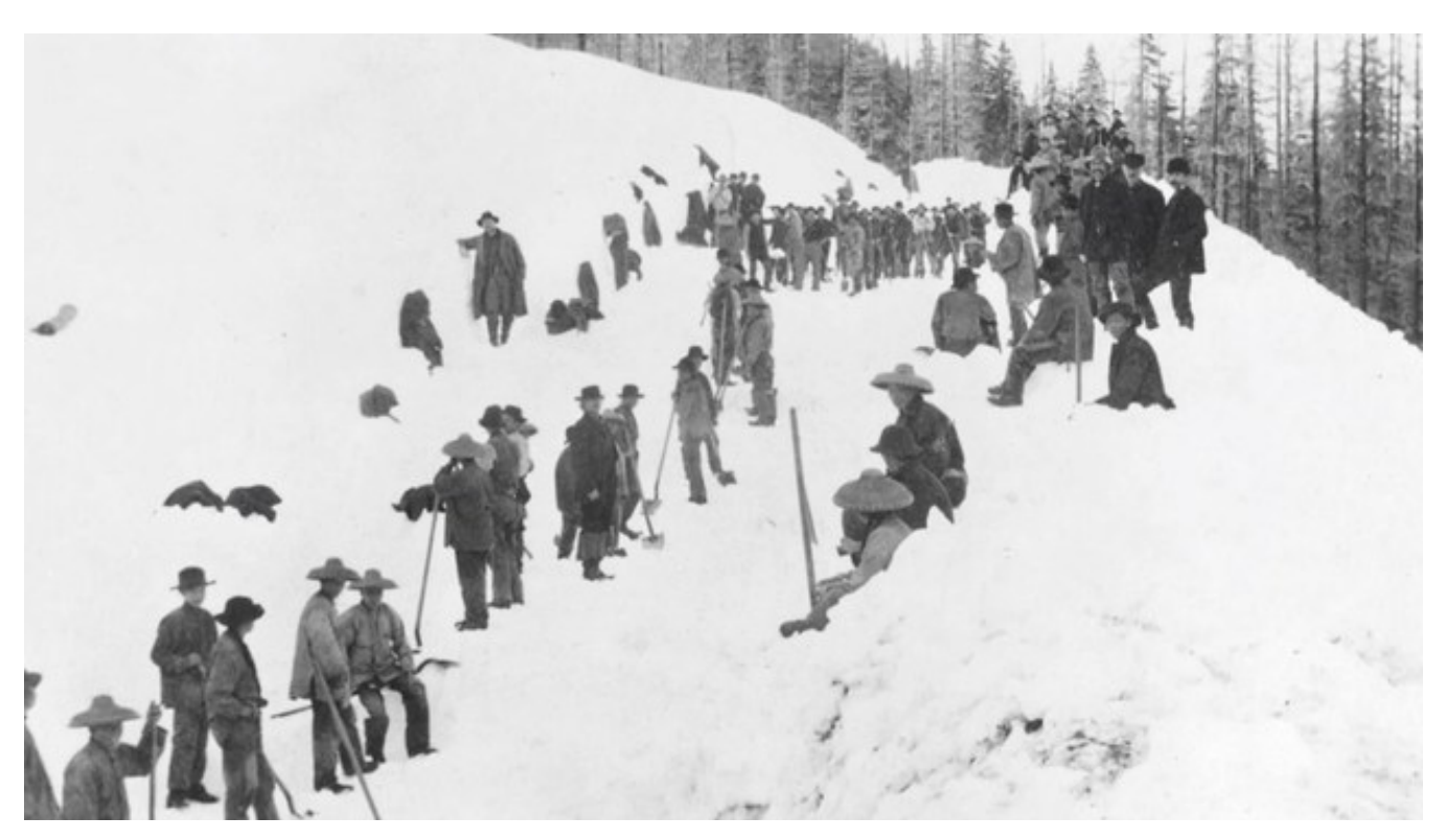
Chinese immigrant work crews prepare to excavate a snow-covered portion of the Central Pacific Railroad's route in the Sierras.