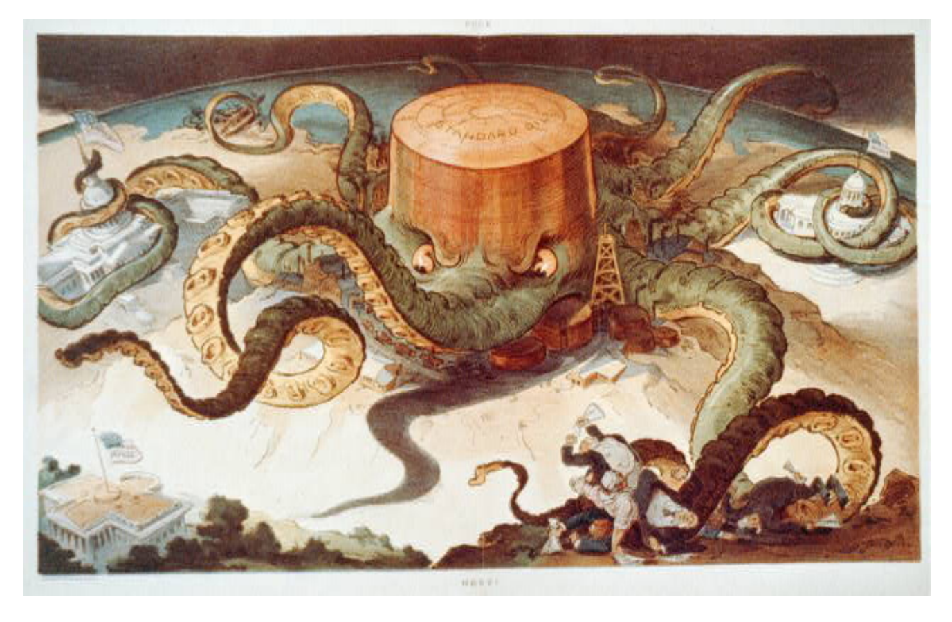
Udo Keppler, "Next!" photomechanical print, September 7, 1904.