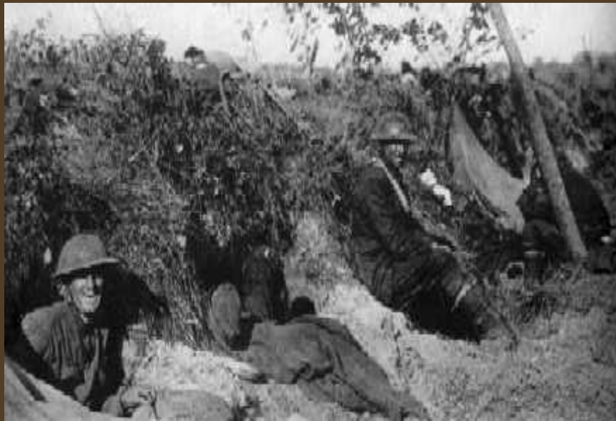
Men of the 42nd Division during the Second Marne. These men were killed by artillery fire just 5 minutes after this photo was taken