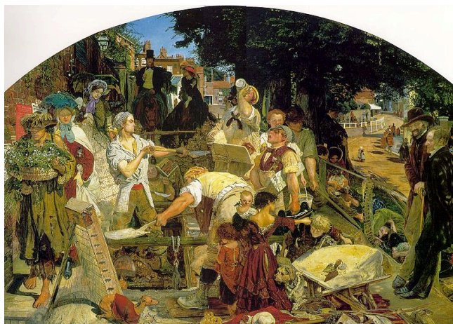
'Work' by Ford Maddox Brown, 1852-65

which is generally considered to be his most important achievement. It attempts to portray, both literally and analytically, the totality of the Victorian social system and the transition from a rural to an urban economy. Brown began the painting in 1852 and completed it in 1865, when he set up a special exhibition to showcase it along with several of his other works.