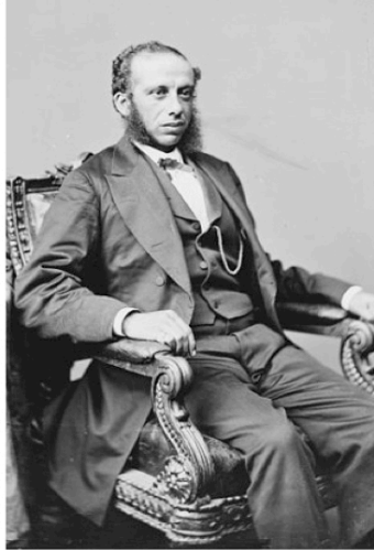
Robert DeLarge U.S. Representative South Carolina 1871-1873