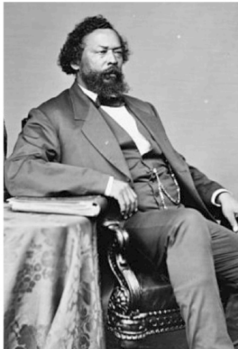
Benjamin Turner U.S. Representative Alabama 1871-1873