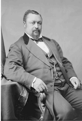
Blanche Bruce U.S. Senator Mississippi 1875-1881

During Reconstruction, thousands of African Americans were elected to local and state governments throughout the Southern states. In addition, 17 African Americans were elected to the United States Congress from Southern states between 1870 and 1877. Here are photographs of 6 of these 17 elected officials.