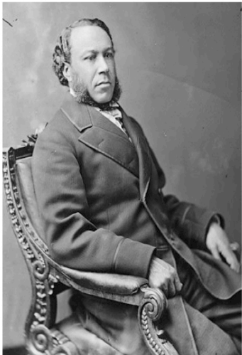
Joseph Rainey U.S. Representative South Carolina 1870-1879