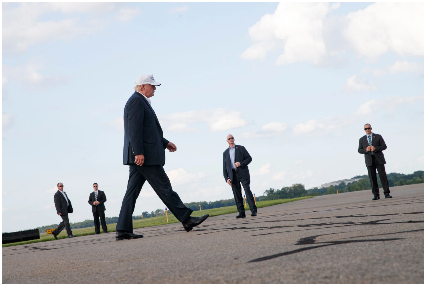
President Trump heading to board Air Force One under the watchful eyes of his security staff.

In one three-month period last year, the Secret Service spent about $63,000 at Mar-a-Lago and more than $137,000 on golf carts at Trump's Florida and New Jersey clubs.