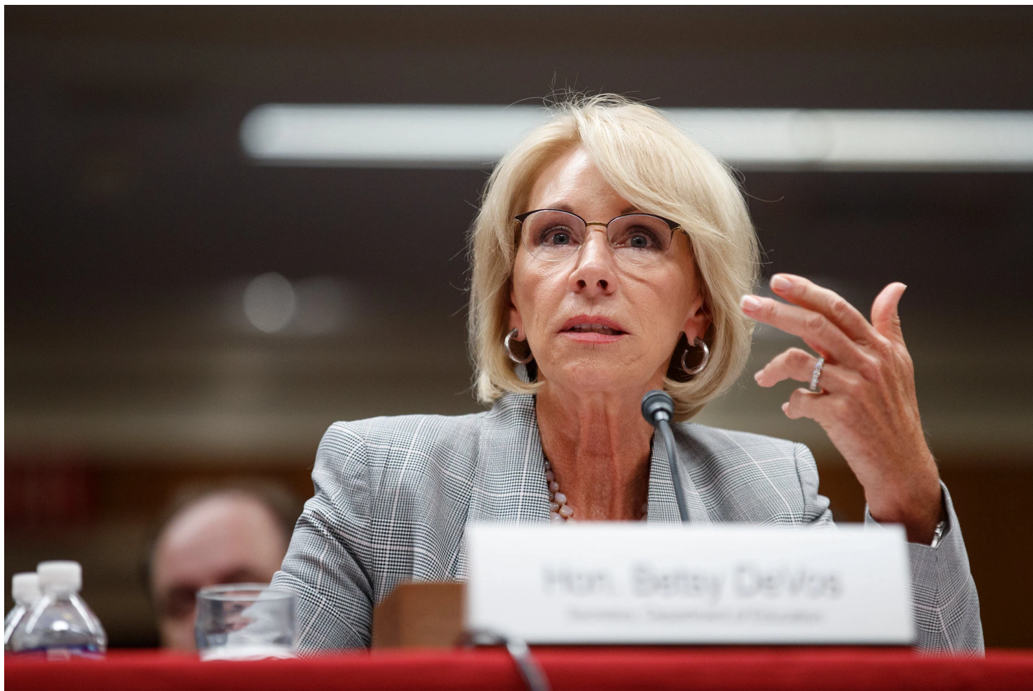
Betsy DeVos testifying before the Senate Appropriations Committee.