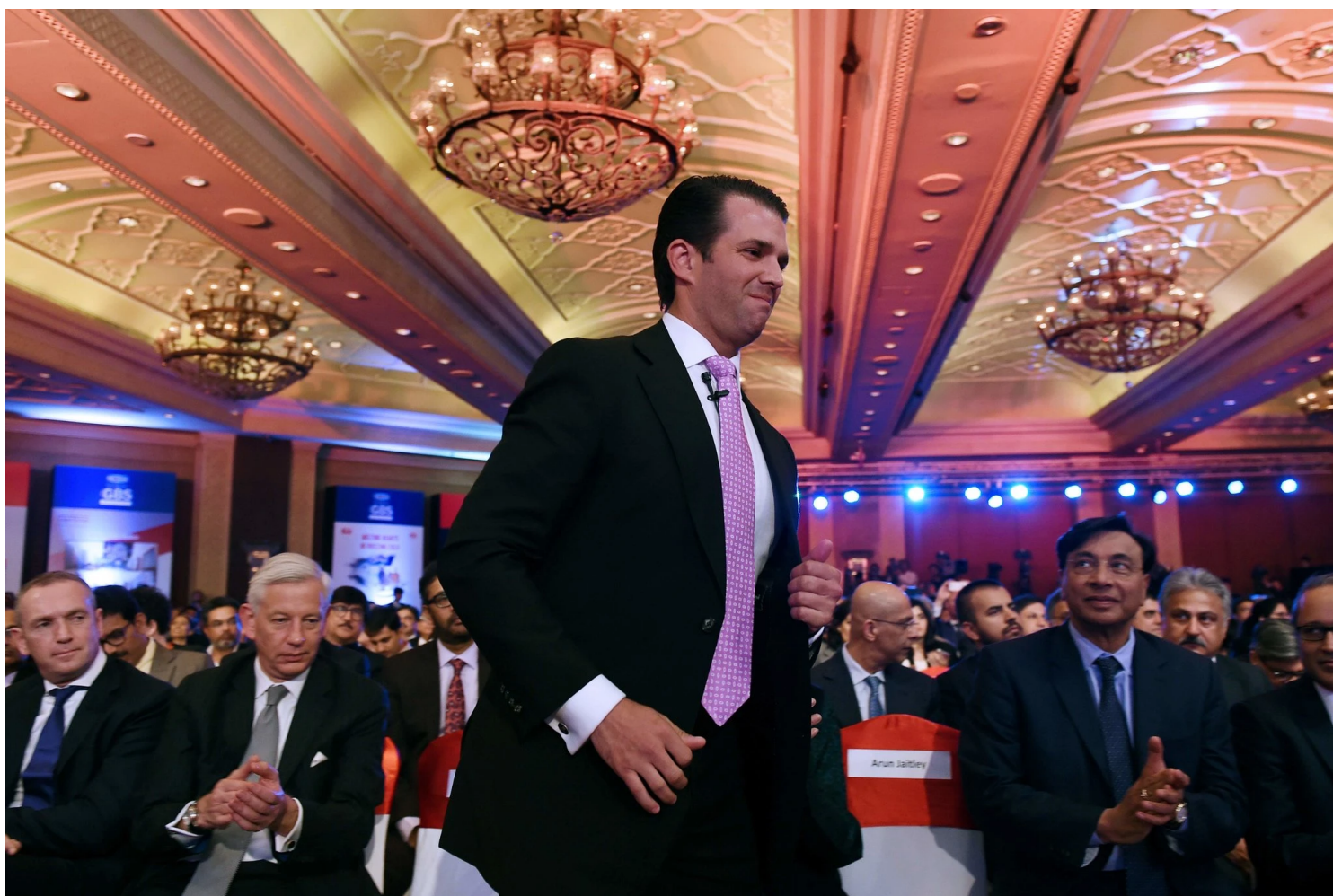
Donald Trump Jr., taking the stage during the Global Business Summit in New Delhi, India.

During Trump's presidency, his companies have pushed to expand overseas, with help from foreign governments. One example: In May, an Indonesian real-estate project that involves the Trump Organization reportedly received a $500 million loan from a company owned by the Chinese government. Two days later, Trump tweeted that he was working to lift sanctions on a Chinese telecommunications firm with close ties to the government — over the objections of both Republicans and Democrats in Congress. He ultimately did lift the sanctions.