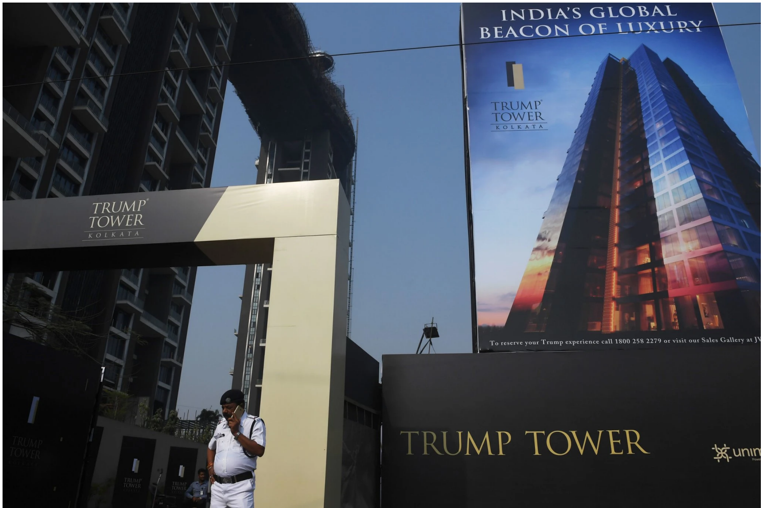
Security officials outside a Trump Tower construction site in India.

Trump's businesses have also moved to expand in India, the Dominican Republic and Indonesia, using deals directly with foreign governments.