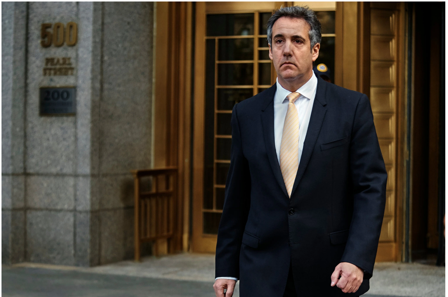
Michael Cohen, Trump's former lawyer and fixer, after a court appearance in August.