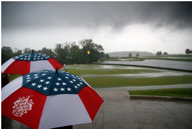
White House staff members using Trump-branded umbrellas at his golf club in Bedminster, New Jersey.