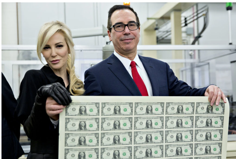
Steven Mnuchin and his wife, Louise Linton, holding an uncut sheet of $1 notes bearing Mnuchin's name.

Steven Mnuchin, the Treasury secretary, looked into whether he could use a military plane to fly him to Europe for his honeymoon. Later, he used military planes for several trips. The Treasury Department's inspector general concluded that Mnuchin broke no laws by doing so, but criticized Mnuchin's insufficient explanation for why he needed to spend $800,000 on the trips.