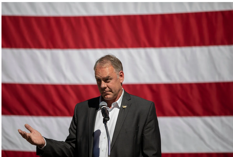
Ryan Zinke at a speaking event earlier this year.

Pruitt, the former head of the E.P.A., chartered flights for questionable travel, among many other things. He also pushed to fly Delta rather than the government's contract carrier, to accrue frequent flier miles. He flew first class and stayed in hotels that were more expensive than those allowed by government standards. And he let lobbyists help arrange foreign trips for him.