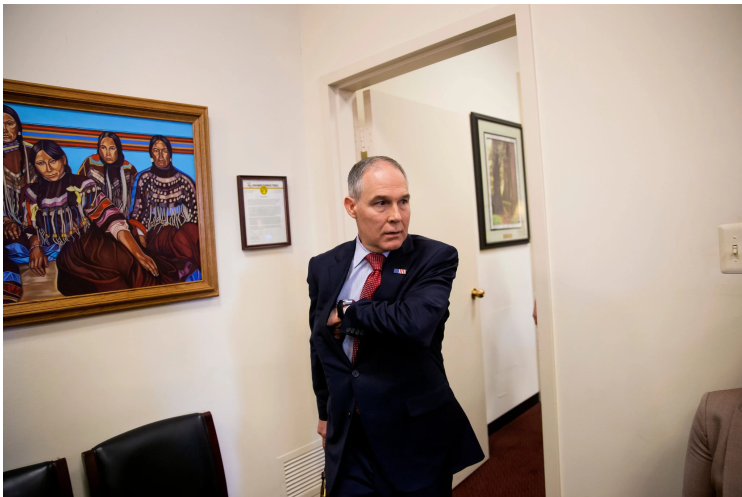
Scott Pruitt's numerous scandals led him to resign his position as head of the E.P.A.

The president and his aides have repeatedly shown they are willing to use the government's prestige and power to help their friends and relatives make money.