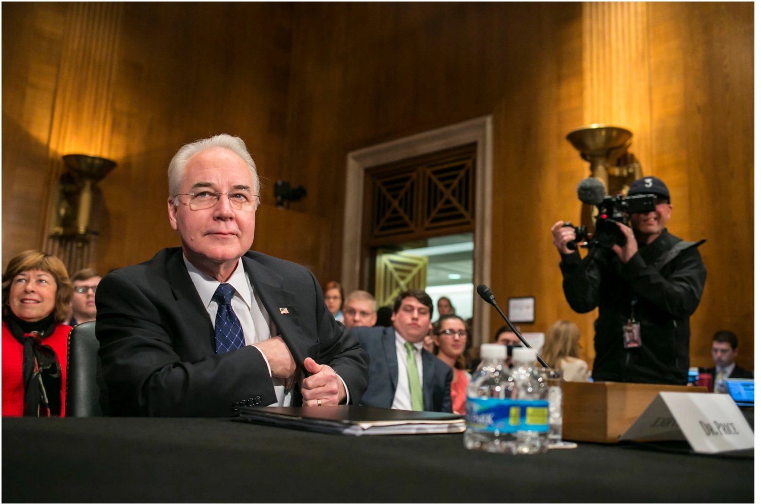
Tom Price during his nomination hearing.