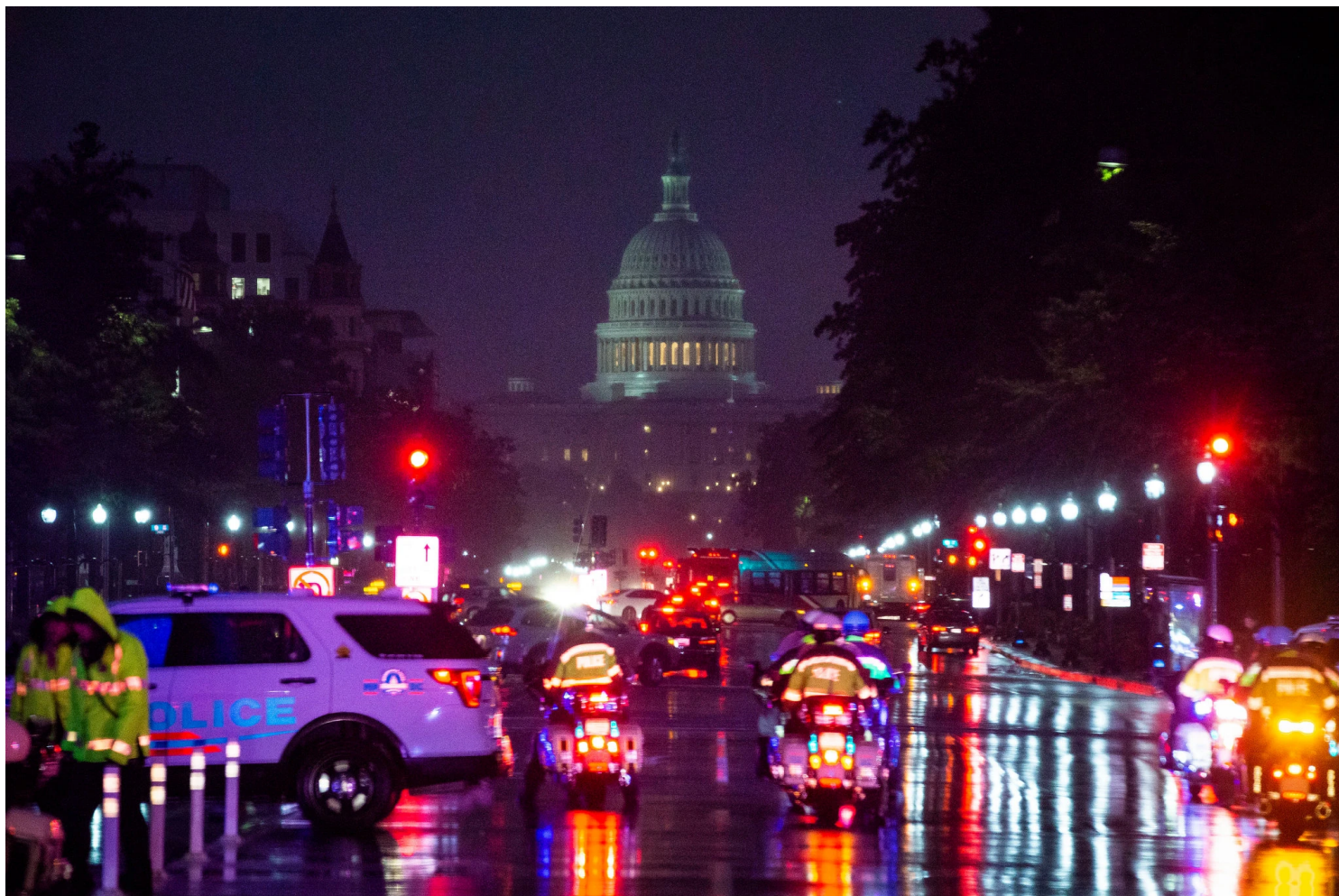
President Trump's motorcade driving to dinner last month at the Trump International Hotel in Washington.

The biggest scandal of all, however, is not even the corruption of the Trump administration. It's the inaction of Congress.