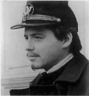
Matthew Broderick as Col. Shaw

In February of 1863, the first black fighting unit raised in the North in the Civil War - the legendary 54th Regiment of Massachusetts Volunteer Infantry - was assembled under the command of Col. Robert Gould Shaw, a 25-year-old white Bostonian and veteran of the battle of Antietam. Whilst there were already regiments of freed slaves in existence, this was the first regiment which contained a substantial number of Northern blacks. Despite the fact that the regiment was being encouraged by both senators and by the Government, attitudes towards it were not all positive.