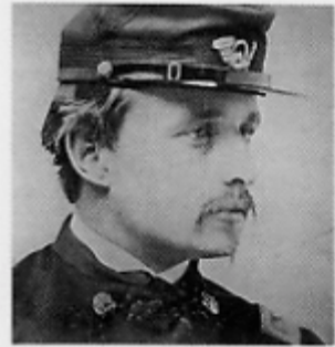
Col. Robert Gould Shaw