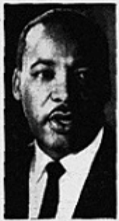
DR. MARTIN LUTHER KING