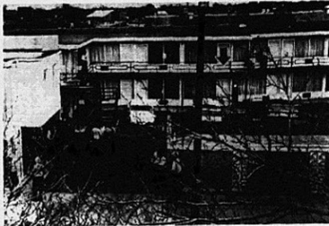
Arrow Indicates Where Dr. King Was Standing When Assassinated

Ralph McGill A Free Man Killed By White Slaves White slaves killed Dr. Martin Luther King in Memphis. At the moment the trigger