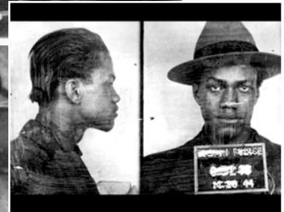
Talmadge X Hayer

Malcolm X, 39, is carried from Audubon Ballroom, 188th St. and Broadway, after he was shot while addressing a rally of his followers yesterday afternoon. He was taken to the Woodhull-Lothrop Hospital at the Woodhull-Lothrop Medical Center, which is 15 blocks from the scene of the attack. The men were taken to the scene from a building next to Wood-rod's Tailors who were protesting them on the street after the assassination. The film 'Supra' had been changing the film's line with printing in all his over since he de-facta from the group.